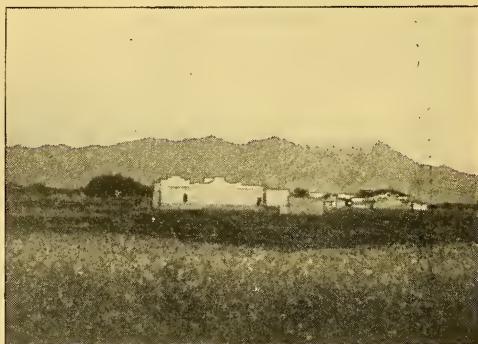
A FOOCHOW VIEW

I spent the night at the chapel and next day carried out the program as planned. They have such funny, narrow boats on the Ing-hok River, flat bottomed where one sits on a straw mat. The boat people are always barefooted and Chinese passengers always remove their shoes when they go on board. Our shoes are not so easily taken off, and the boat woman was quite disgusted because I tracked in a little sand. She said, "These foreigners don't know how to ride in a boat." We were against the tide coming back next afternoon and there was some wind. After rowing for an hour the boat woman said it was too rough, she couldn't get to Uang-bieng; we would go back and start to-morrow morning with the tide. But I said she must go on, so she rowed awhile